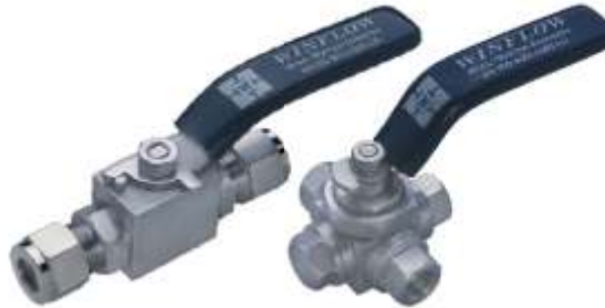
2 HIGH PRESSURE 2, 3, 5 WAY