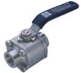
3 THREE PIECE BOLTED

MIC Ball valves are widely used in All types of Instruments, Control panels and pilot plants, Refineries, Process plants, Laboratories and Power Plants, Hydraulic and Pneumatic piping, The field of Chromatography, Steam generation and food processing, High-pressure Hydraulic systems and Equipments. Many other areas of instrumentation and research.